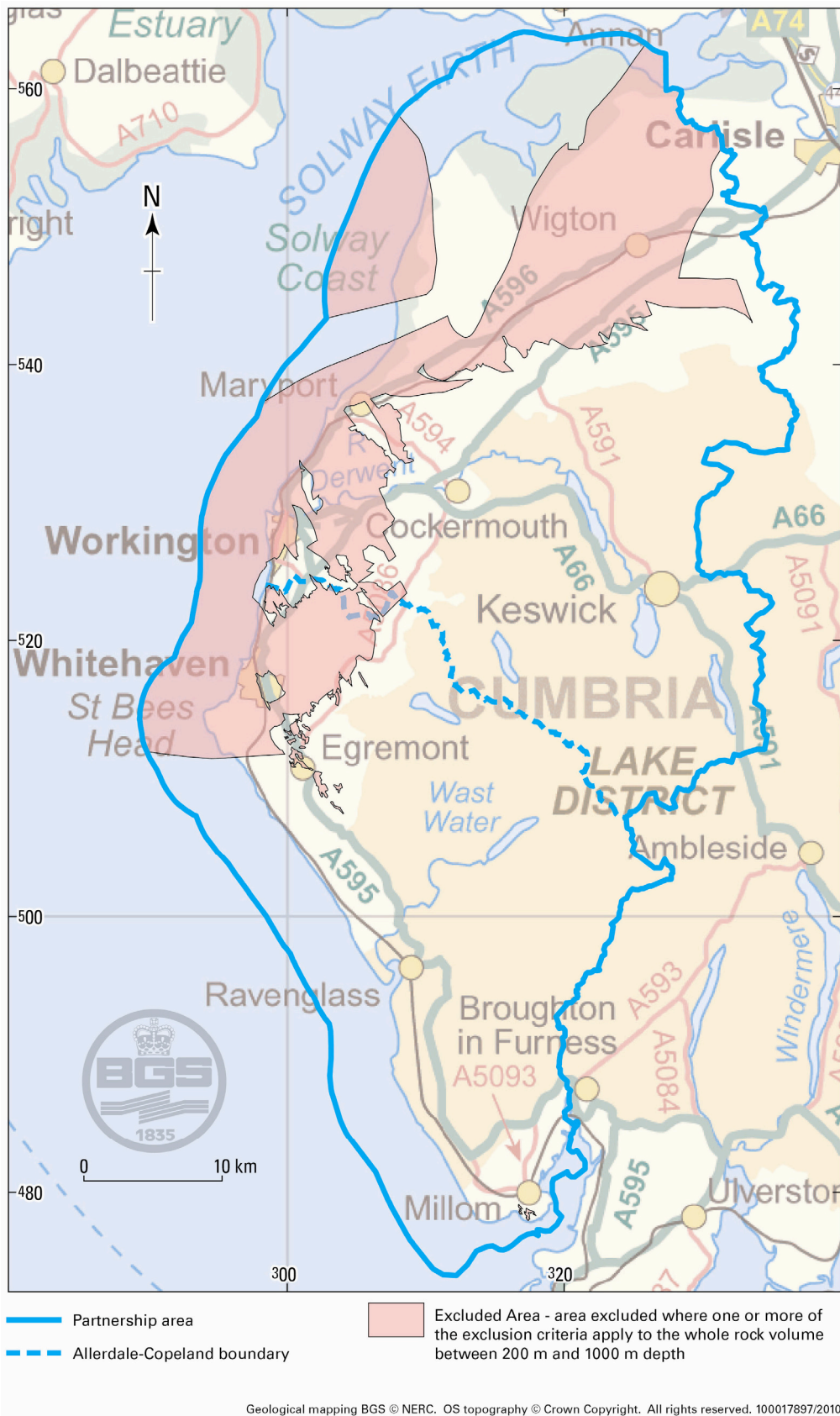
Figure 2. The West Cumbria MRWS Partnership area showing areas screened out (exclusion areas) where one or more of the exclusion criteria apply to the whole rock volume between 200 m and 1000 m depth. The Excluded Area is shown overlain on the 1:1 m scale Ordnance Survey base map. All information other than the Excluded Area (shown in pink) and the boundaries of the screened area (shown in blue) is taken from the Ordnance Survey base map and is shown for context only. Dashed blue line indicates the Allerdale-Copeland boundary.